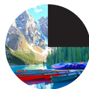
ONE QUARTER OF EACH EYE (called quadrantanopsia )